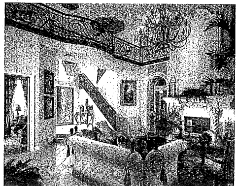
LIVING ROOM MAY BE SHOWN WITH OPTIONAL FEATURES